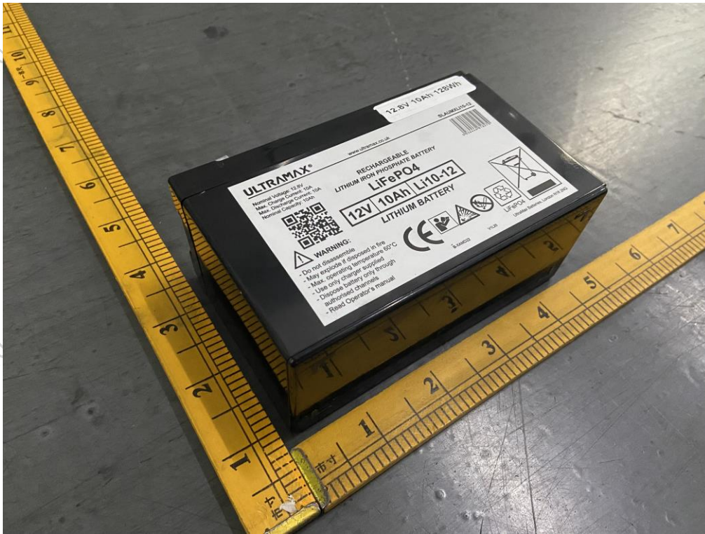
Figure 1 Overall view I of battery