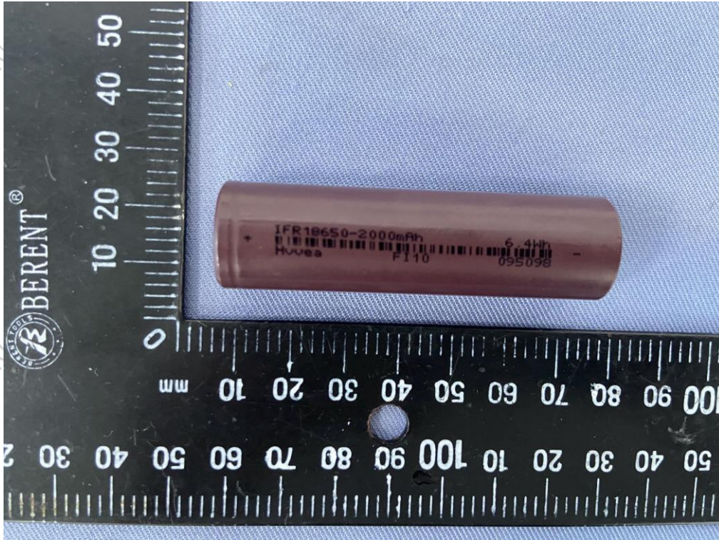
Figure 3 Overall view of cell