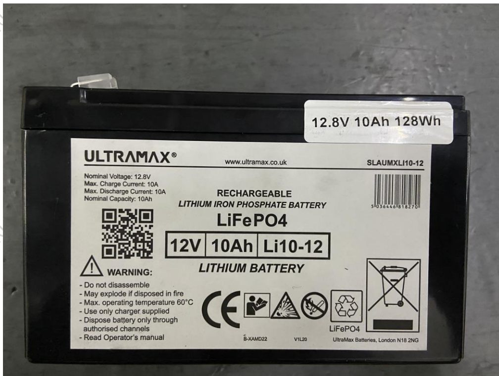
Figure 4 Battery Label